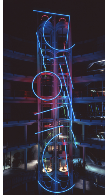
Left: Stephen Antonakos, Untitled Drawing (Neons for the Stadtsparkasse Cologne) , July 1992. Graphite and colored pencil on paper, 26 × 10 1/8 inches. Scale: 1:50. Right: Stephen Antonakos, Neons for the Stadtsparkasse , 1993. (Interior tower) Painted metal, neon, 100 × 26 feet. Stadtsparkasse, Cologne, Germany, 1993.