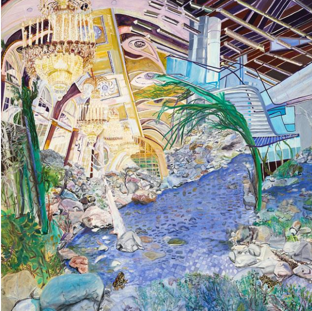
Olive Ayhens, “Interior Wilderness” (2009–10), oil on linen, 60 x 60 in

pictorial details. This contradiction is the work's central, animating paradox. It's unclear to what extent the artist's subject matter is cultural symbol, narrative device, autobiographical marker, or just the fun of paint — as, for example, the mismatched pair of midcentury modern lounge chairs in the foreground of “Remembering my Chickens”(2010). Wine-red, they snap against a cluster of prickly cacti rendered in a range of greens, manically dashed and dotted in pale tints and near-white with a tiny brush: a painter's joke