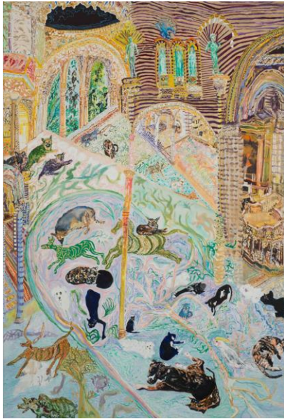
Olive Ayhens, "Memories of Beasts Past" (2013), oil on linen, 47 x 32 in

More often, though, Ayhens uses linear perspective not to anchor space but to destabilize it, as in "Cockatiels and Crystals" (2013). An improvisation on the interior of Grand Central Station, the painting folds together opulent Beaux-Arts decorative flourishes, shimmering glass windows, polished marble floors swarming with tiny pedestrians, a bank of escalators, and of course those fabulous chandeliers. Dotting the canvas and surveying the scrambled scene are eight yellow-and-orange parrots; the painting's bird's-eye view places the gallery-goer right up there among them.