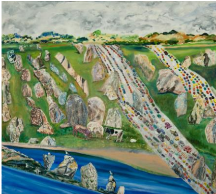
Olive Ayhens, "Carnac" (2011), oil on canvas, 39 x 40 in

realism to dissolve into pure abstraction. That these elements are knit together just a bit uneasily adds to the works' power and charm.