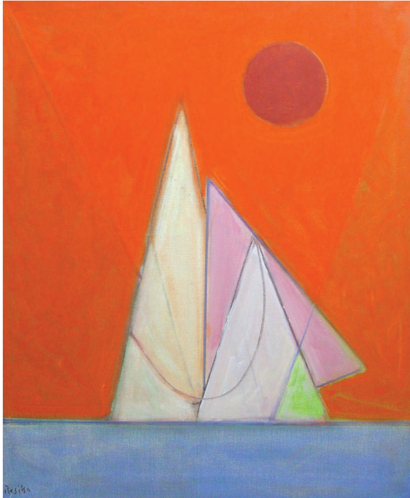
Red Passage 2009, oil, 48 x 40. All artwork this article courtesy Lori Bookstein Fine Art, New York, New York.