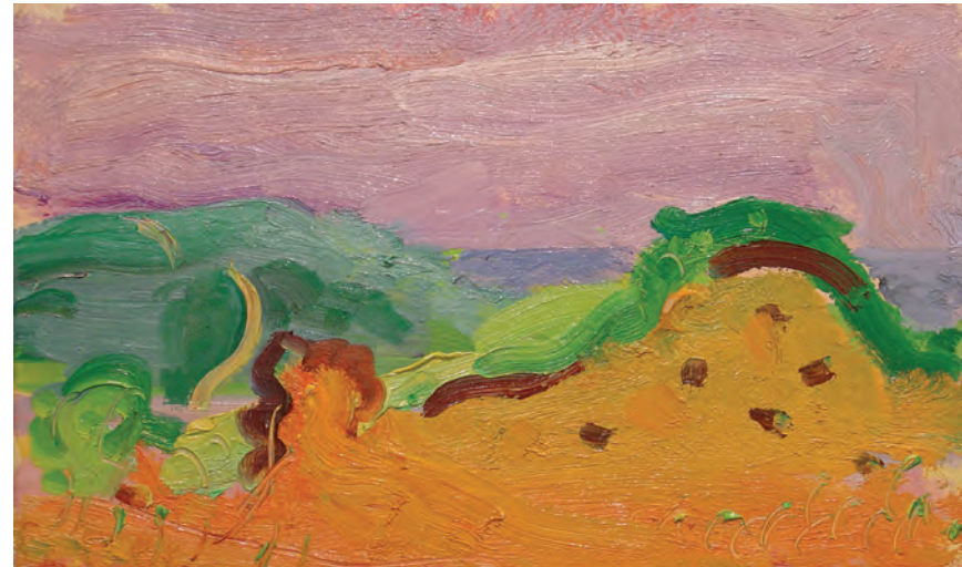
LEFT Dragon Dune 1977, oil on board, 8½ x 13¾.