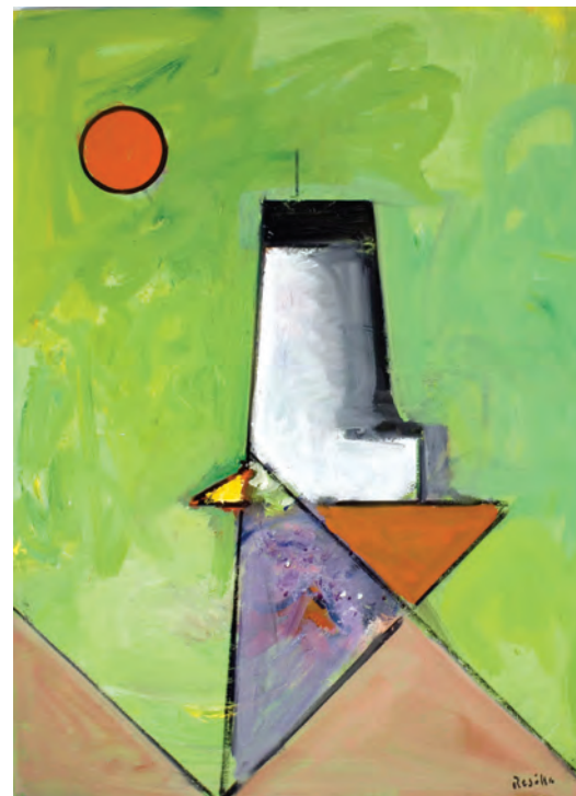
OPPOSITE PAGE, ABOVE Treasure Beach 2008–2009, oil, 60 x 72.