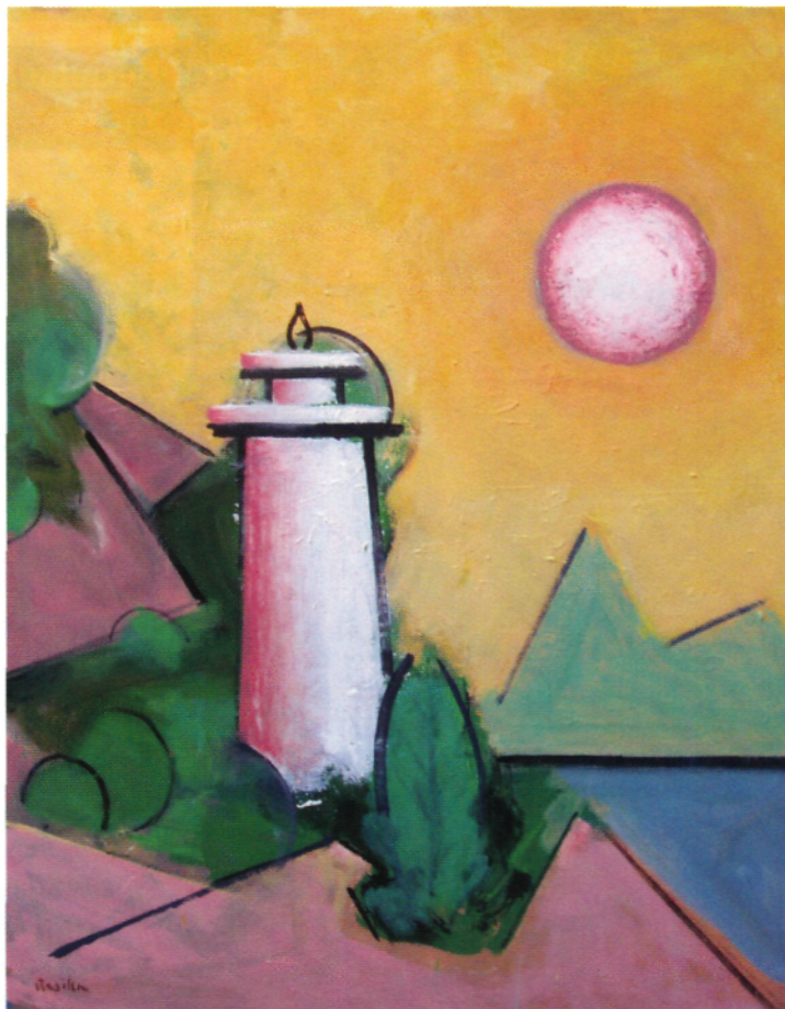
The angular forms in "The Candle" add a dynamic rhythm to the composition.

Contact: 508-487-6411; www.bertawalker.com