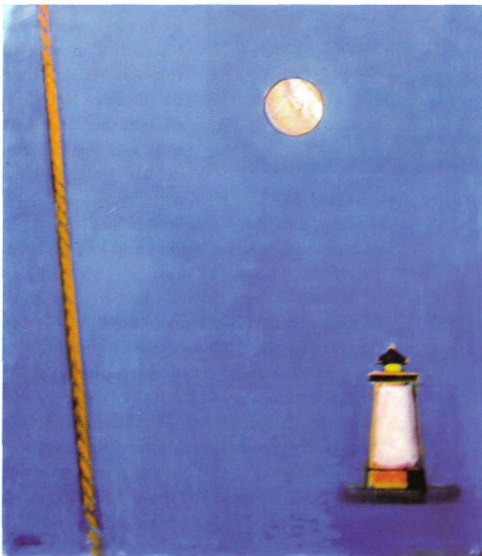
The lighthouse in Resika's "Blue Lighthouse" seems afloat in a sea of blue.