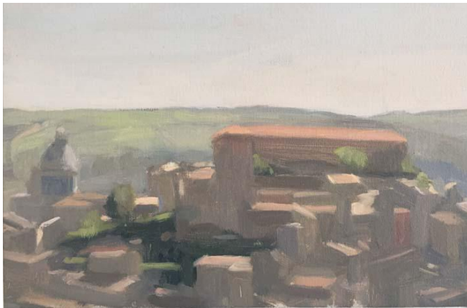
Diana Horowitz, Ragusa Ibla , 2017, Oil on linen, 6 x 9 inches.

By Peggy Roalf | Wednesday, November 11, 2020