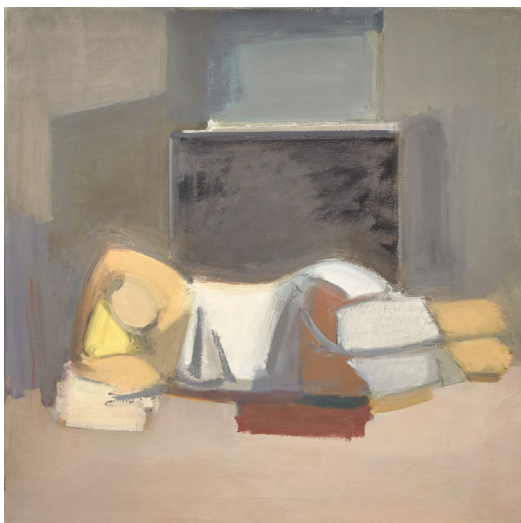
Untitled, c. 1998-04, oil on canvas, 32 x 32 inches.