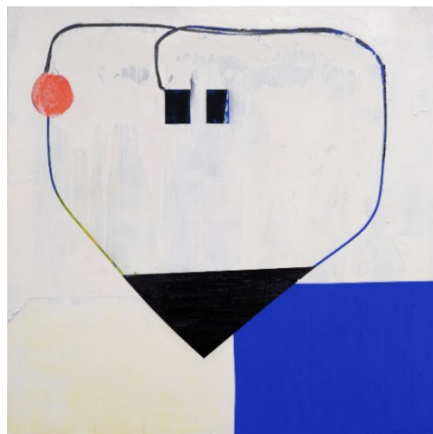
Hiroyuki Hamada, Untitled Painting 040 , 2020, Acrylic on wood, 48 x 48 inches. (BP#HH-8523)

Hiroyuki Hamada: New Work will be on view from March 10 – April 15, 2022. Gallery hours are Monday through Friday, 11:00 am to 6:00 pm. For additional information and/or visual materials, please contact the gallery at (212) 750-0949 or by email at info@booksteinprojects.com .