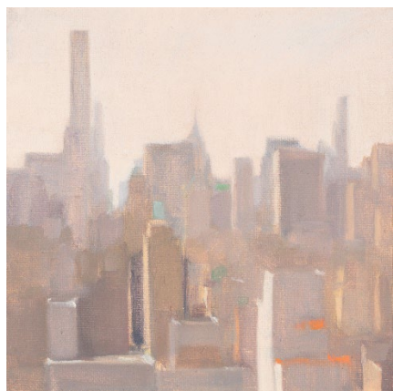
Diana Horowitz, South from Uptown #1 , 2022, Oil on canvas board, 6 x 6 inches. (BP#DH-8926)

Reception: Wednesday, March 5 th from 6:00 - 8:00 PM