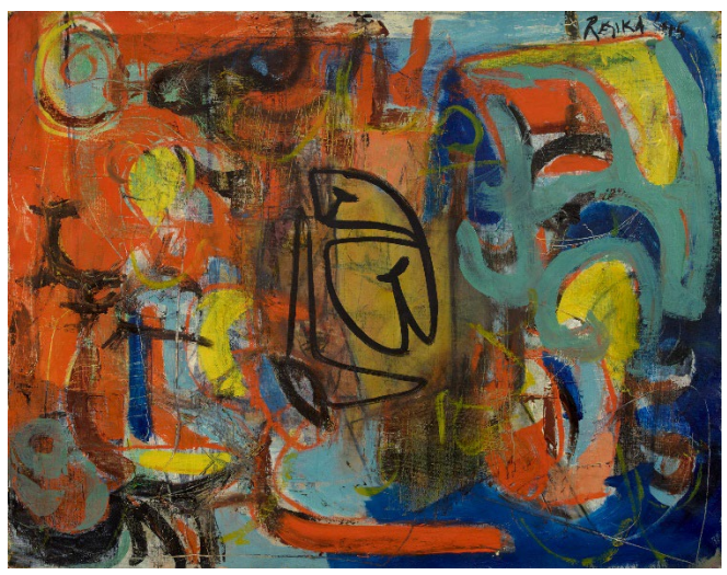
Paul Resika, Virgin , 1945, Oil on canvas, 28 x 36 inches. (BP#PR-9525)

Bookstein Projects is pleased to announce an exhibition of paintings by Paul Resika. This is the artist's fifteenth solo show with the gallery.